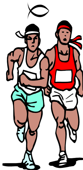
Team members race to the finish line .....Christ's amazing love.

Please hold these brothers and sisters in Christ in prayer as they prepare to share Christ's love with our guests.