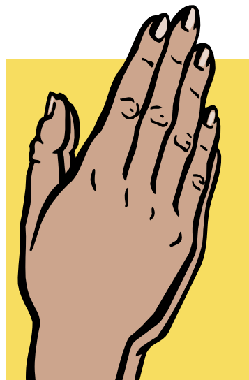
Five fingers of prayer